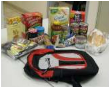
Typical BackPacker foods

On November 16, Sodexo Providence Schools was awarded a $4500 Grant to be spread over the next three years, from the Sodexo Foundation ( http://www.sodexofoundation.org/ ) to fund the Providence BackPacker program. This money will be donated to the Rhode Island Food Bank for the sole use by the Providence BackPacker's. This school year we have 86 BackPackers and so far we have served 375 meals this school year. Since the BackPacker Program began in March of 2003 we have served more than 20,000 meals to children and their families in Providence.